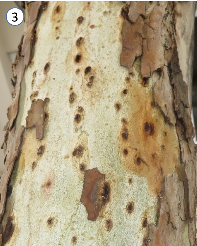
3. Zoom in on affected area.