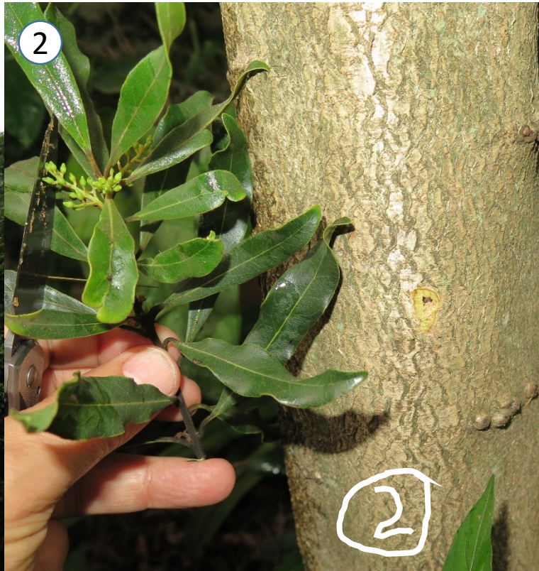
2. Picture to identify tree species including tree number, leaves, flowers/seeds, stem/bark.